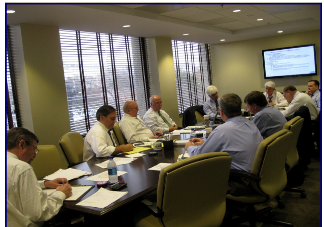
2010 Winter meeting of APA Officers and staff.