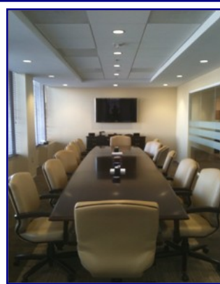
APA Conference Room

The APA is particularly proud that there was no disruption to the work of the association during the project.