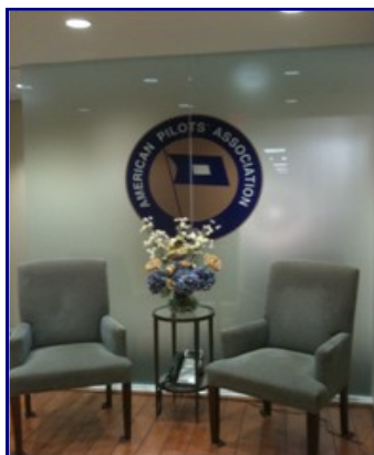
The reception area of the new offices of the American Pilots' Association.