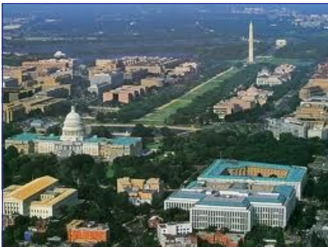
The 2012 APA Biennial Convention will allow pilots and their families to enjoy the sights and visit the historic locations in our Nation's capitol.