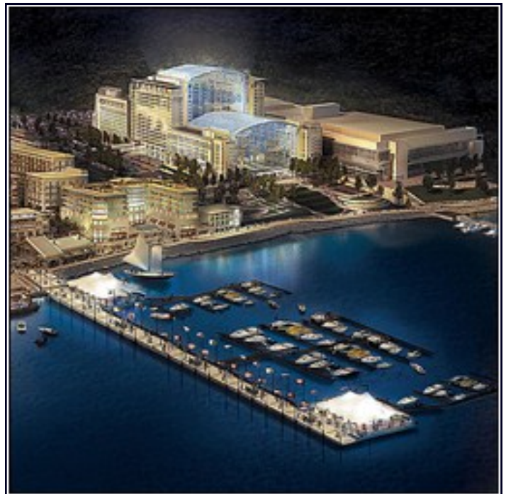
An aerial depiction of the Gaylord Resort and Convention Center at National Harbor, site for the 2012 APA Biennial Convention.

As the Convention dates get closer, look for more information in upcoming editions of ON STATION and from your local pilot group officers.