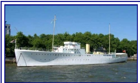
HQS Wellington, moored along the banks of the Thames River in London, is the headquarters of IMPA and recently hosted the 64th meeting of IMPA's Executive.

The meeting, which was held the weekend before the 87th session of IMO's Maritime Safety Committee, had a lengthy agenda covering numerous topics, including an update on recent developments with the various IMO committees and subcommittees.